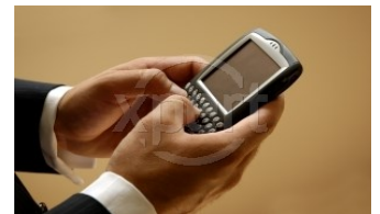
Mobile Access to Sage CRM

ing, Project based Sales Activity, Receivable Follow-up.